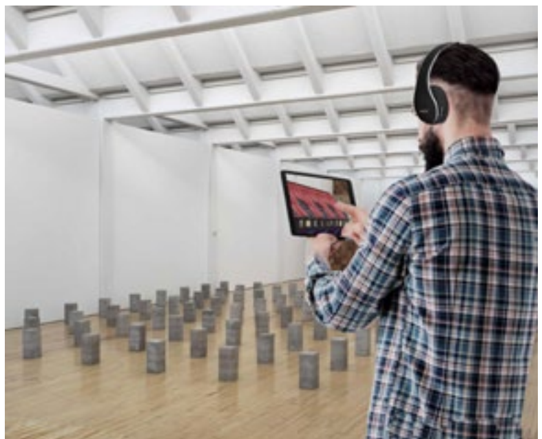
Reference and mockup image: Installation by Carl Andre at Dia:Beacon

The audience will be able to interact with the installation through iPads with headsets run-ning the "Memorial Rocas AR" app version adapted to this exhibition.